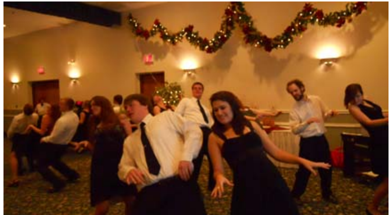
UWMC Performing Choir

The first ever Great Plains Parallel District Conference was held Nov. 5 - 7 in Bloomington, MN. 307 Optimists from 6 states as well as several Canadian provinces gathered to share ideas about how to serve more youth as well as to have a little fun! We had a chance to attend some of the more than 20 break out sessions on topics such as new member recruiting, how to identify new needed youth projects, and suggested effective mentoring methods. Booths were set up throughout the week-end exhibiting some of the more innovative regional adopted projects including REACHaChild, Dollars for Scholars, and the Rochester Brighter Tomorrow initiative.