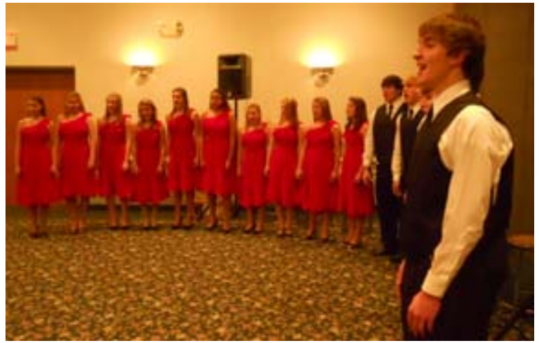
Wausau West Master Singers