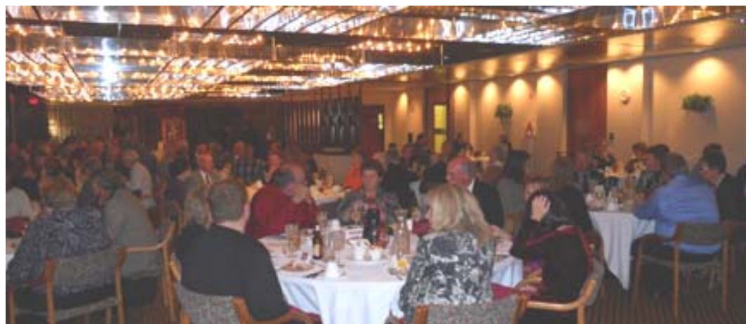
Photo of our 50th Anniversary/Installation Banquet

Our guest speakers donate their time to present their topic to our club. Please be considerate and give them your full attention!