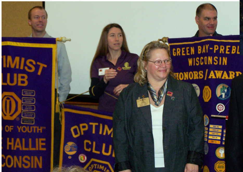
Photos from the First Quarter Conference in Green Bay WI on November 12-13