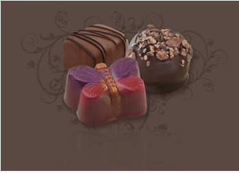
A sampling of truffles from Obsession Chocolates, Eau Claire

Reading 'From the President's Pen' gets me even more passionate about helping others. Every blood donation helps up to 3 people. These people could be your friends or neighbors who have cancer, need an operation, or had an accident. Help them out. Get a friend and make an appointment or drop in at the Blood Donor Center, 3485 Hamilton Avenue, Eau Claire Mon, Tue and Wed: 12:30 p.m. – 6:30 p.m., Thu and Fri: 7:00 a.m. – 1:00 p.m.